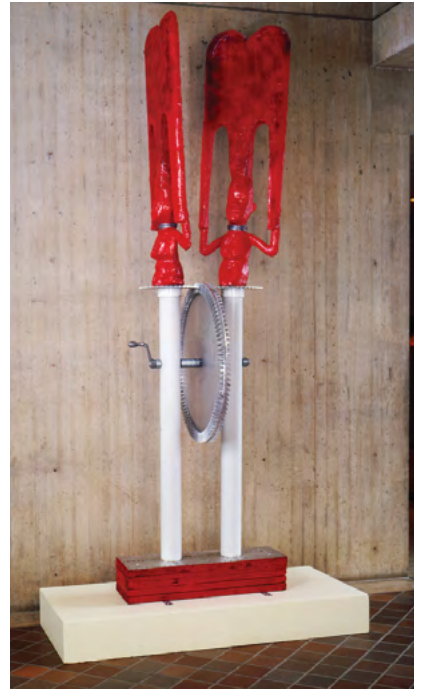
5 Willie Cole, Chango Weather Beater , 1997–2000