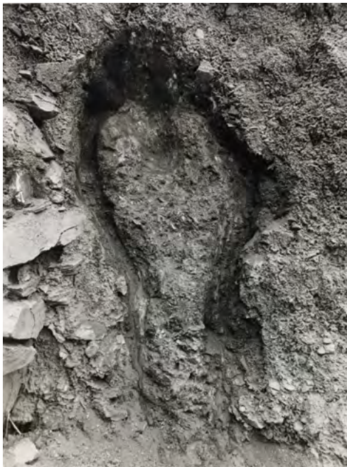
1 Ana Mendieta, Untitled , from the Siluetas series, 1980