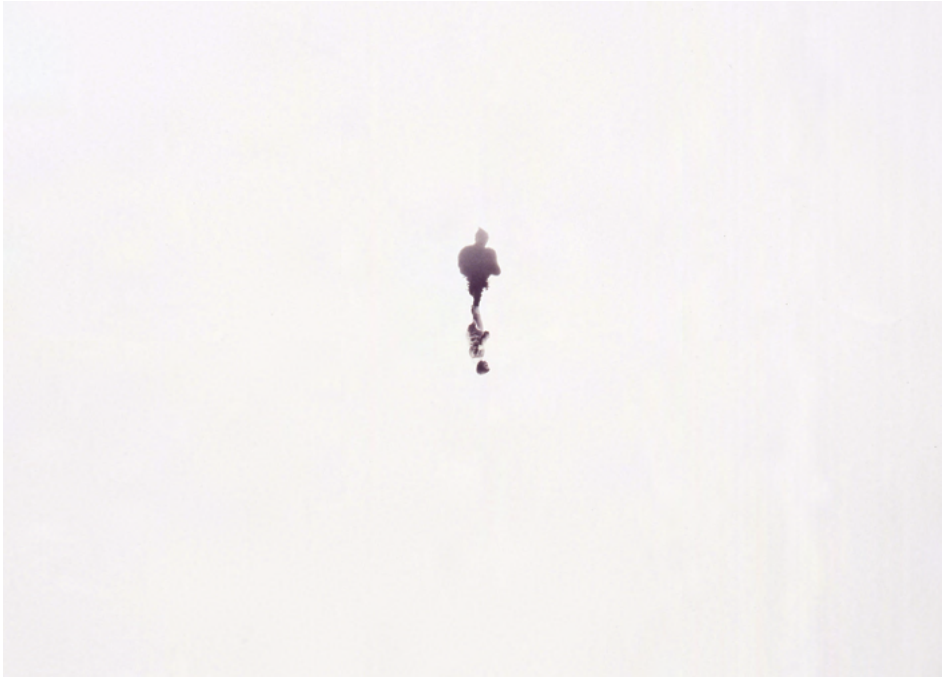
4 Peggy Preheim, Check-mate , 2008