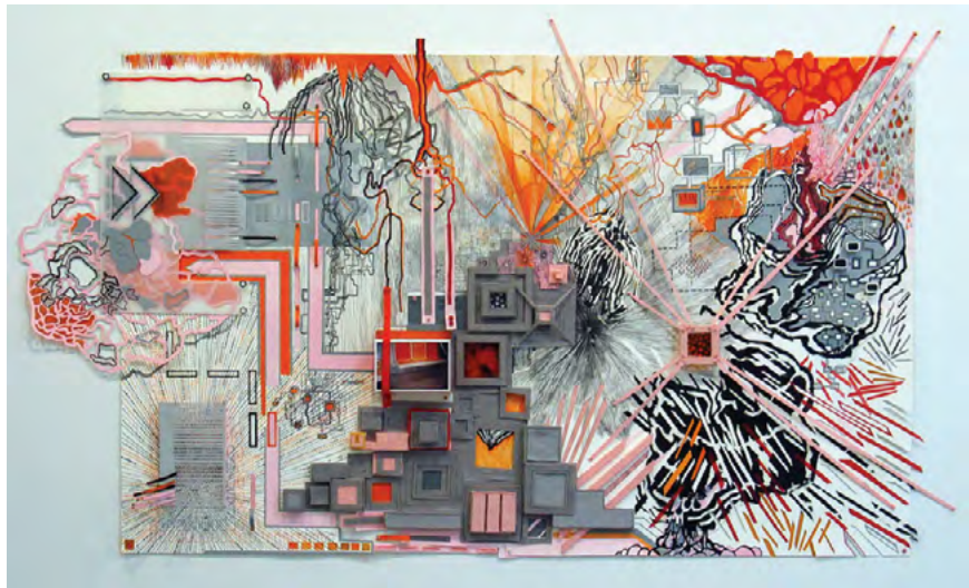
2 Diana Cooper, Trip , 2006